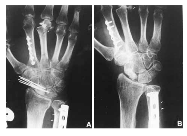
Fig. 6. — Case 2. (A) Three months and (B) one year after surgical open reduction and fixation, radiographs show union of the scaphoid but avascular necrosis of the proximal pole of the scaphoid.

with progressing revascularisation of its proximal pole, and no evidence of radiocarpal or midcarpal arthrosis (fig 7). Moreover, radiograph analysis revealed a carpal height ratio of 1.60, scapholunate angle of 70° and radiolunate angle of 8°.