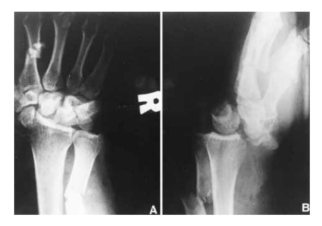
Fig. 4. — Case 2. (A) Posteroanterior and (B) lateral radiographs of wrist show a variant dorsal trans-scaphoid perilunate fracture dislocation.

He initially underwent plate fixation of the distal ulna and second metacarpal and soft tissue repair, as well as reduction of the carpal lesion with an external fixator, but the reduction of the carpal fracture was unsuccessful (fig 5). Reduction of the perilunate fracture-dislocation was performed one week after the initial surgery, using a combined dorsal and palmar approach. Severe damage of the dorsal capsule and ligament was found, and the proximal pole of the scaphoid, which was nearly free and had no capsule attached to it, was interposed in the separated midcarpal joint. A variant of transscaphoid perilunate dislocation was proved by complete rupture of the scapholunate ligament, the dorsal capitate-hamate interosseous ligament and an undislocated lunatotriquetral joint. Following repair of the volar capsular rent, the scapholunate ligament was repaired by direct suture via a drill hole on the scaphoid side with 3-0 nonabsorbable sutures and the scaphoid fracture and scapholunate joint were stabilised with K-wires. Additional K-wires were used to stabilise the lunatotriquetral and capitate-hamate joint; the wrist was then kept in the neutral position with an external fixator.