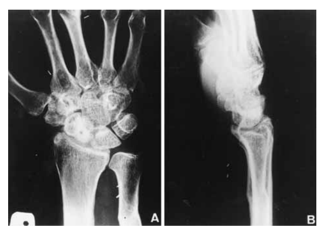
Fig. 7. — Case 2. Three years after operation, radiographs show progressing revascularisation of the proximal pole of the scaphoid without arthritic changes in the radiocarpal or mid-carpal joint.

Concurrent scaphoid fracture with scapholunate ligament rupture has two presentations. The more