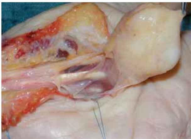
Fig. 2. — Intraoperative view. The well-circumscribed tumour has just been shelled out.

scopic appearance was confirmed by histology : The major component of the tumour was benign adipose tissue, which contained lobules of mature cartilage (fig 4). Lipocytes and chondrocytes lacked any mitotic activity or nuclear atypia. Occasionally, small strands of fibrous tissue were present. The tumour was enclosed within a thin fibrous capsule.