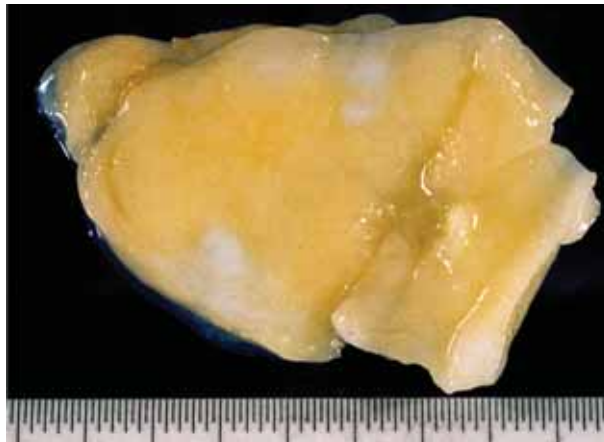
Fig. 3. — Macroscopic view of the cut surface of the tumour. It is predominantly composed of fat (yellow areas), in which lobules of cartilage (white areas) are detectable.

Chondrolipomas are rare tumours which can be found in almost any anatomical site, particularly in the connective tissue of the skeletal system, breast,