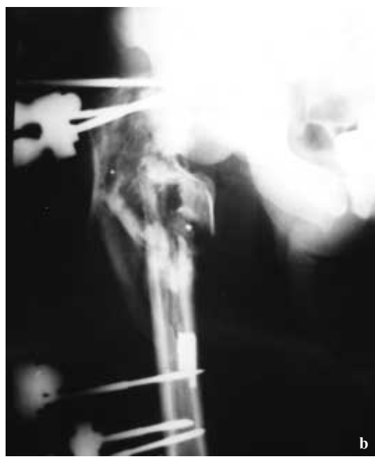
Fig. 1.—a. Xray of a compound fracture of the proximal femur two months after Gamma nailing with subsequent infected nonunion. b. Collapse of the fragments after two months of external fixation, in another compound fracture of the proximal femur with all pins on the femur.

pelvifemoral external fixation device at the Institute of Orthopaedic Surgery and Traumatology in Belgrade.