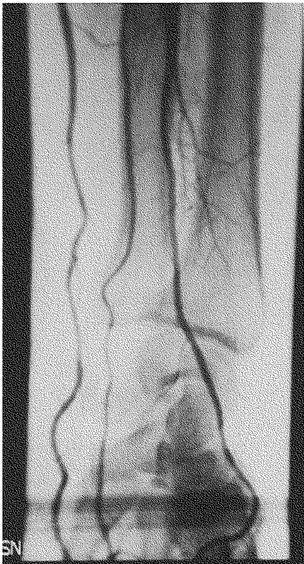
Fig. 2. — Arteriography shows a persistent median artery at the elbow and the wrist, with the same diameter as before and with good flow.

graphy showing a patent artery supported our decision.