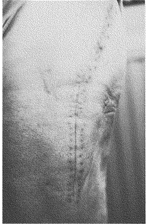
Fig. 1. — Cosmetic appearance of both methods in the same patient after bilateral hip replacement a. Subcuticular with linear scar. b. Transdermal with cross-hatching scar.

in comparison to the transdermal group with a range of 4 to 9 (mean 6.5). There was a significant difference between the two groups with a p value of < 0.01 .