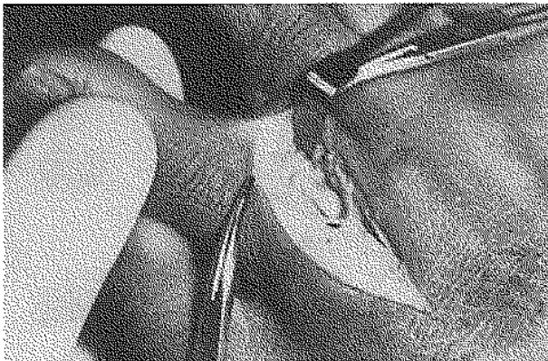
Fig. 1. — Exposure of the digital nerve.

A longitudinal dorsal incision is made in the relevant web space, and deepened directly in line with the interspace until the metatarsal heads are identified. The intermetatarsal ligament is carefully divided, bringing the neurovascular structures into view. After identification of the neuroma (fig. 1), the two distal branches of the nerve are sectioned distally and then the nerve is dissected free and sectioned out as far proximally as possible so that at least 3 cm of the nerve is removed proximal to the neuroma, as a number of plantar branches can branch off up to 3 cm proximal to the bifurcation and these can be a cause of pain due to impingement. After a sufficiently proximal resection, the nerve can retract into the intrinsic muscles, away from the weight-bearing area of the forefoot (5, 7).