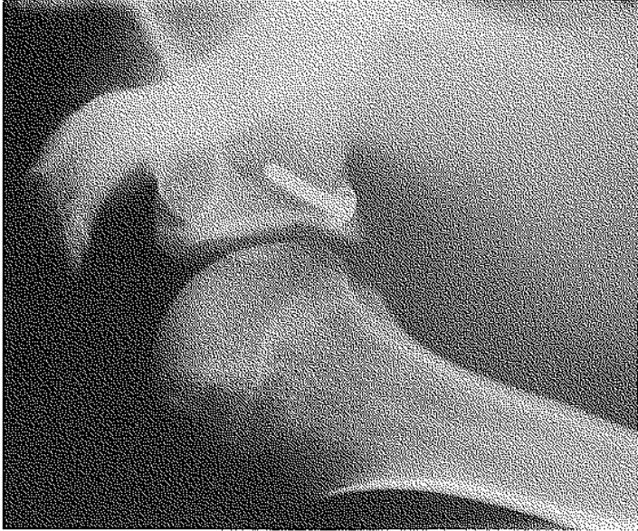
Fig. 2. — Radiographic AP-projection of screw-fixation with a washer.