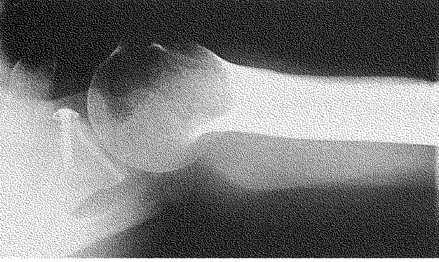
Fig. 4. — Radiographic epaulettic projection of screw-fixation with a washer.