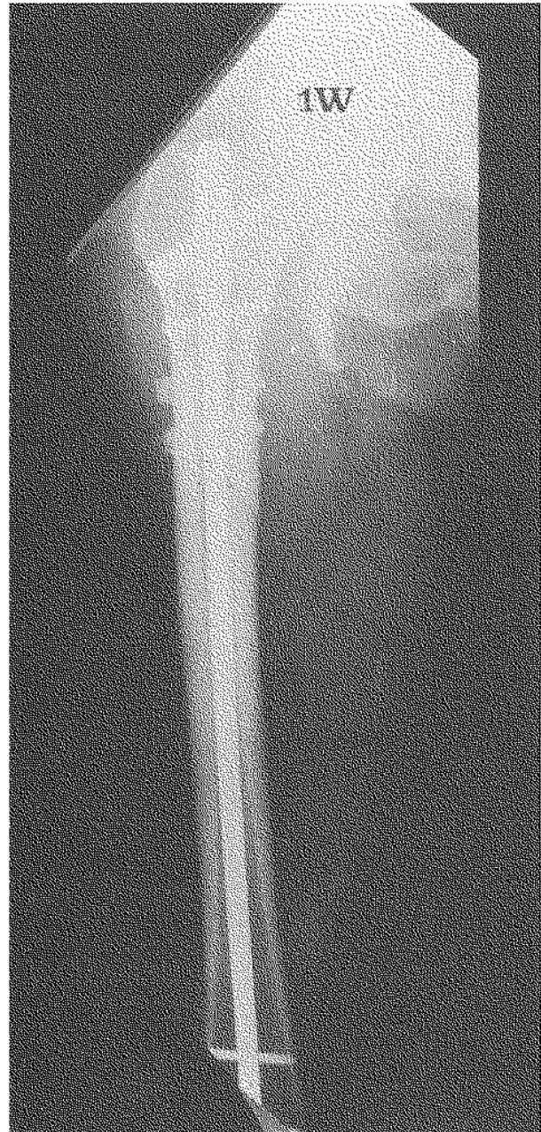
Fig. 1. — Subtrochanteric fracture treated with UFN-SB and Partridge bands.

All patients were followed-up prospectively for at least six months or until their death. Special attention was given to the mechanical complications and bone healing. We considered bone healing to be delayed if no progressive healing was observed on serial x rays after 4 months.