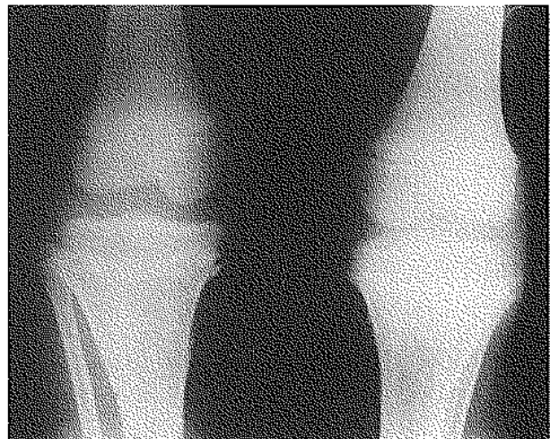
Fig. 1. — D. Radiograph of knees at the age of 9 years shows good remodeling but growth plates of proximal tibial epiphysis are narrowed.

A few months later he sustained a non-displaced fracture of the right elbow, which healed with immobilization in plaster for two months. On a recent examination at the age of 9 years, the patient was still very active but more cooperative. His height was 122 cm and weight 23 kg (both at the 10 th percentile). His general condition was good. Hyperpigmentation was noted in the posterior aspect of the elbows and over the knees. Tendon reflexes were diminished, abdominal and cremaster reflexes were hypoactive. Radiographs showed no abnormalities in the spine and hips. Radiographs of the knees showed complete healing but the proximal growth cartilage of both tibiae was narrow (fig. 1-D). The right elbow was normal and the left one showed neuropathic changes (fig. 2-A). The right ankle appeared normal, but the left was swollen and radiographs showed neuropathic changes (fig. 2-B). Most of his teeth were missing and scarring of the lips and the tongue in association with wasting of the maxillofacial area, gave an appearance resembling a "toothless old man" (fig. 3).