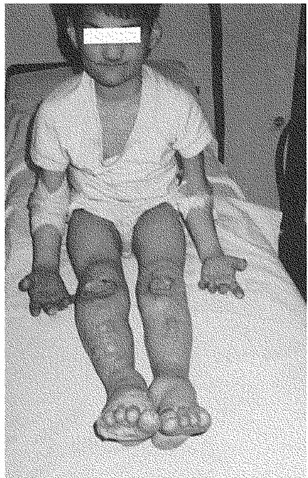
Fig. 3. — Photograph of the patient at the age of 9 years shows scarring of lips and wasting of maxillofacial area. The fingertips of almost all fingers are missing and their ends are rounded. Ulcerations of knees and the foot, swelling and deformity of the left ankle are also noted.

The fingertips of most fingers were missing and the nails were dystrophic. Ulcerations on the anterior surface of the knees and posterior surface of the elbows had recurred, but there had been no new fracture for the last 13 months. The knees and the ankles were slightly swollen and the skin of the legs below the knee was edematous with some hard nodules (fig. 3). Despite the family's support and the help from psychologists the patient manages to escape supervision and to take part in sports like basketball and football.