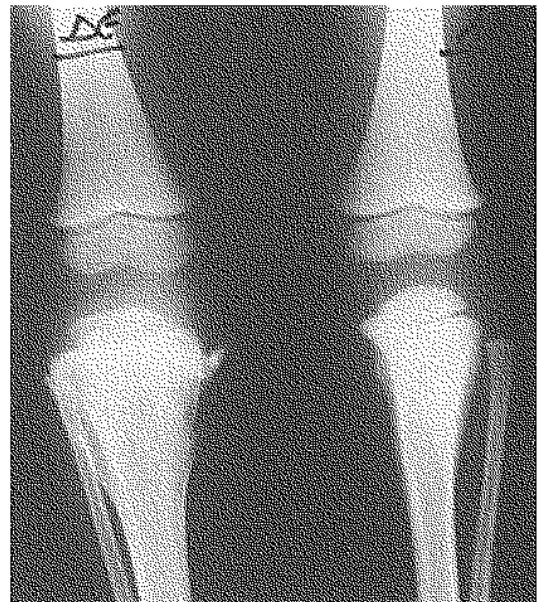
Fig. 1. — B. Good reconstruction after 4 months of immobilization in plaster. The proximal part of the contralateral tibia shows densification and periosteal reaction.

and his mother said he never sweated, even in very hot weather or when running high temperatures. He was noted also to touch hot objects and receive burns without complaining. Nevertheless, superficial sensation to light touch was intact. There was some scarring on his lips and tongue, the tip of which was missing as a result of biting. For the same reason his fingertips showed scarring and absorption. Many of his teeth were missing. Bruises in several parts of his body were also noted. Corneal reflexes were absent and tear production was reduced. Tendon reflexes were hypoactive. He was hyperactive trying to compete with his healthy twin brother, but was cooperative. Routine laboratory tests were unremarkable. Radiographs of both tibias showed increased bone density of the metaphyseal-epiphyseal region of the proximal end of the right tibia, hyperplastic bone formation and disorganization. (fig. 1-A). An above knee plaster of Paris was applied which was soon destroyed and had to be replaced repeatedly. Radiographs 4 months later showed reorganization of the proximal end of the right tibia, but periosteal reaction and increased density was noted in the metaphyseal region of the upper end of the left tibia (fig. 1-B).