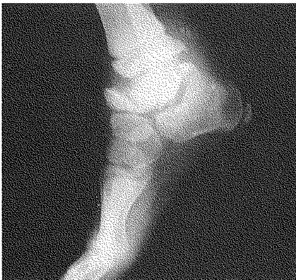
Fig. 2. — B. Neuropathic left ankle joint.

The fingertips of most fingers were missing and the nails were dystrophic. Ulcerations on the anterior surface of the knees and posterior surface of the elbows had recurred, but there had been no new fracture for the last 13 months. The knees and the ankles were slightly swollen and the skin of the legs below the knee was edematous with some hard nodules (fig. 3). Despite the family's support and the help from psychologists the patient manages to escape supervision and to take part in sports like basketball and football.