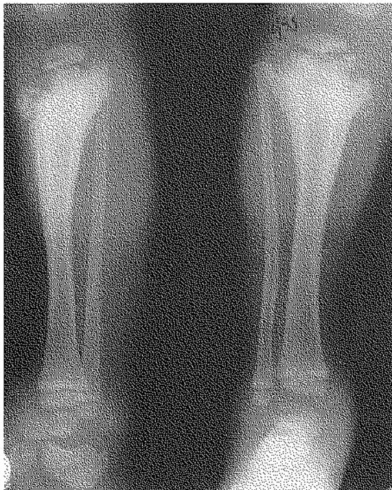
Fig. 1. — C. In spite of immobilization in plaster for three months, bone remodeling of the proximal end of the left tibia was not satisfactory.

An above knee plaster of Paris was applied to the left leg, which was again repeatedly destroyed and replaced (fig. 1-C) and immobilization had to be continued for another three months until satisfactory reconstruction in both tibiae was demonstrated (fig 1-C). Ulcerations of the anterior surface of the knees and a perforating ulcer in the foot were treated with debridements, aseptic dressings and efforts to prevent external pressure on these areas by various means with great improvement.