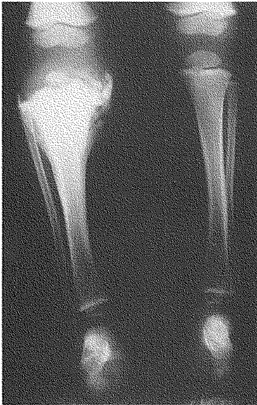
Fig. 1. — A. Bone density of the proximal part of the right tibia following fracture and neuropathic knee joint.

admitted to the children's hospital at the age of 8 weeks and was treated for bronchopneumonia with antibiotics. After eruption of teeth at the age of 7 months, he was noticed to bite his tongue, lips and fingertips causing bleeding. Later he kept losing his teeth either by biting or self-extraction. He walked at the age of 15 months and spoke words at 17 months. He continued presenting intermittent fevers and bouts of bronchitis (postinfectious asthma), which became less frequent with age. He was