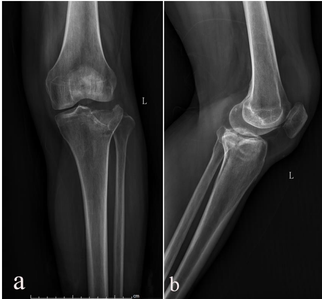
Fig. 1. — A 54-year-old female sustained from an electric bicycle accident was surgically treated through the anterolateral approach. a, b Preoperative anteroposterior and lateral X-ray views showed the collapse of the lateral part of tibial plateau.

Definition of malreduction included PTS \geq 15^\circ or \leq -5^\circ , MPTA \geq 95^\circ or \leq 80^\circ , lateral condylar width > 5\text{mm} , or intra-articular step-off > 2\text{mm} .