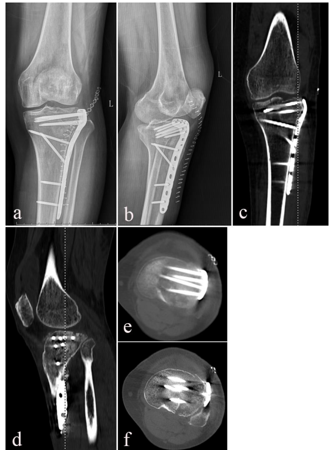
Fig. 3. — Postoperative X-rays and CT views showed collapsed articular surface was satisfactorily restored. a, b Anteroposterior and lateral views. c Coronal view. d Sagittal view. e, f Axial view.