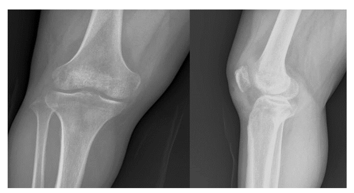
Fig. 3 — Postoperative view of one of our patients.

Arthroscopic assisted internal fixation became a preferred technique with the advances in arthroscopic devices and minimally invasive techniques especially for types III and IV, non-reducible type II, and chronic displacement of type I injuries<sup>11,14</sup>.