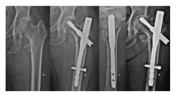
Figure 2. — A-B. Unstable trochanteric hip fracture (AO 31A2) in 82 years old female patient, fixed with short CMN. C. Note the poor reduction in L view. D. Three-month postoperative X-ray shows cephalic screw cut-out.

Reduction quality has been pointed out as a predictor of failure after proximal femur-fixation with CMN<sup>14,15</sup>. In the present study, we observed that the failure rate increased significantly as the reduction quality decreased. Our findings are consistent with Kashigar et al.<sup>16</sup>, who also used Baumgartner's classification. As