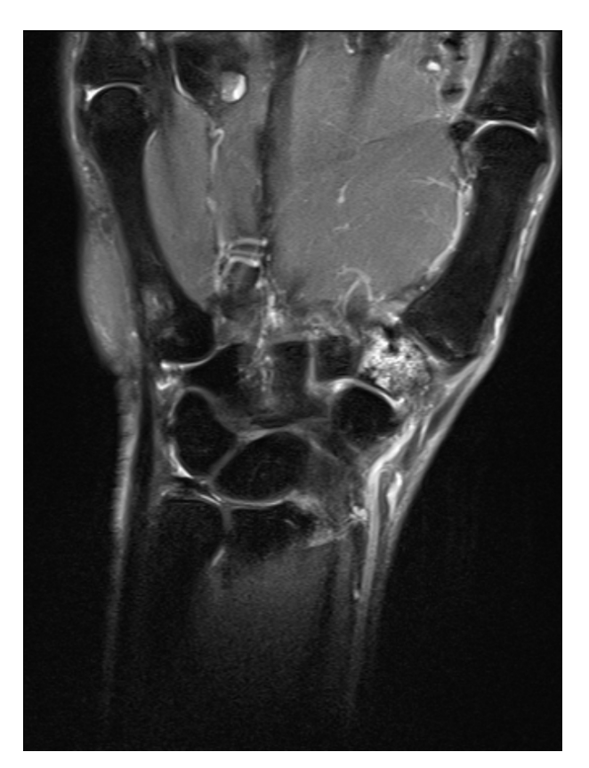
Figure 1. — Left wrist MRI: Coronal T2-weighted Fat Sat image showing a high signal intensity of the trapeziums bone marrow, consistent with edema.

second finger, interfering with her daily activities. The pain causes sleep disorders increasingly for the last weeks.