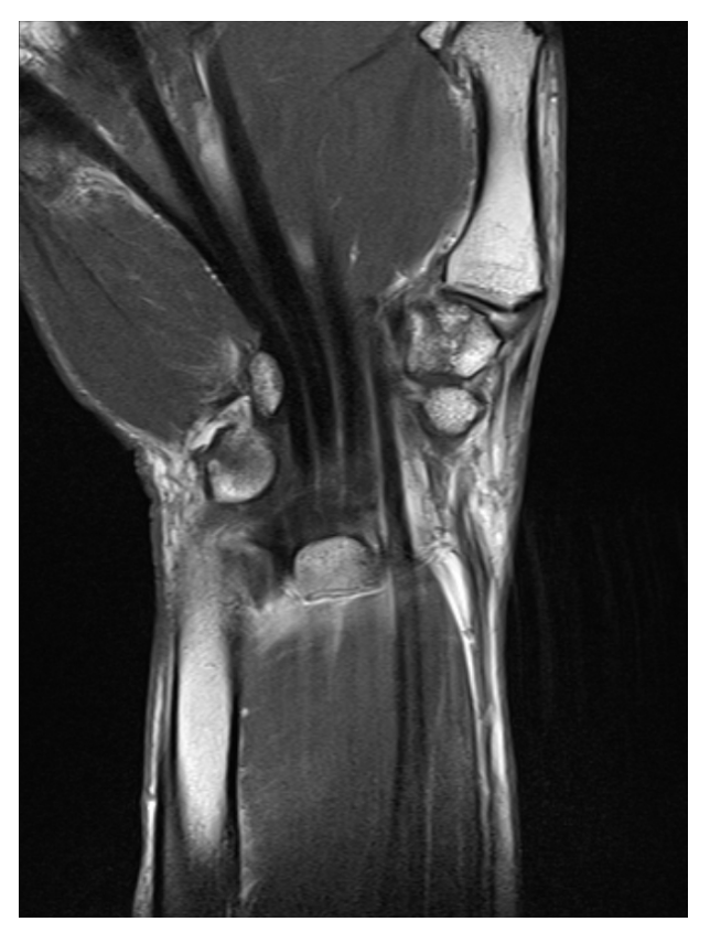
Figure 2. — Left wrist MRI: Coronal T1-weighted image showing a fragmentation of the trapezium.

A posterolateral approach over the trapezium was used to realize a curettage of the cancellous part of the bone, leaving the majority of cortex intact. A 1 cm3 cancellous bone graft of the distal radial metaphysis was taken to fill in the trapezium, followed by the suture of the articular capsule.