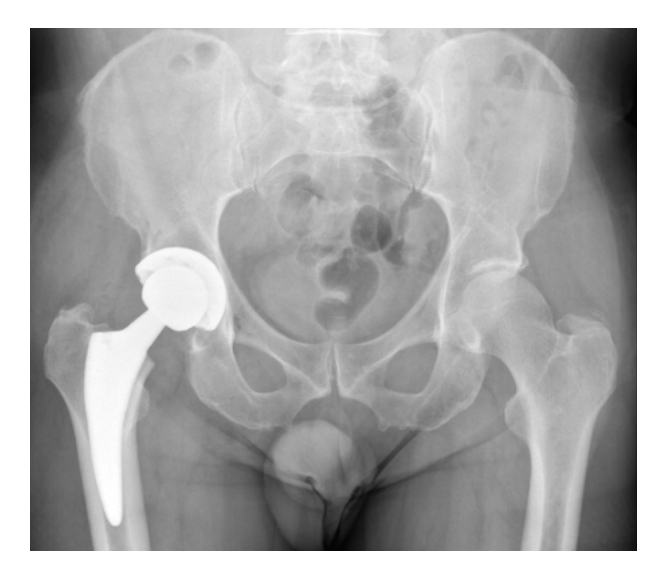
Figure 1. — Postoperative radiograph.

The data of a consecutive series of 80 patients (81 surgeries) eligible for hip replacement were collected in a prospective clinical database. Patient demographics such as age, weight, sex and BMI were recorded at the time of surgery. Hemoglobin (Hb) levels were recorded before and 1 day after the operation. The exclusion criteria included trauma, hip dysplasia requiring acetabular reconstruction, retained hardware and resurfacing procedures. Surgical time, length of stay and complication type, incidence and severity (ICD-10 code and Clavien-