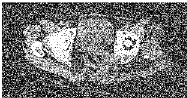
Fig. 1. — Computed tomodensitometry of the left hip showing a desmoid tumor developing around the proximal femur.

A 69-year-old female presented in 1990 with osteoarthritis of the left hip joint. A total hip replacement, using a Charnley-Müller prosthesis, was performed. No tumor was identified during the operative procedure. Initially, the patient's rehabilitation program did not cause any difficulty, and the patient's gait was considered normal 2 months after surgery. Two years after the operation, the patient noted increasing pain and discomfort around the hip. Medical work-up revealed a mass around the prosthetic hip joint (fig. 1) and