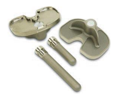
Fig. 1. — NexGen MIS Tibial Component (Mini-keel) ; Zimmer Biomet Inc., Warsaw, IN, USA.