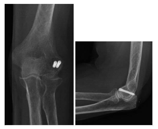
Figure 2. — Type 1 fracture (post op radiographs).

Mayo Elbow score was excellent for seven patients, good for three patients, and fair for three