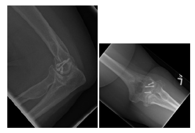
Figure 3. — Type 3 fracture (post op radiographs).

patients. One patient could not be assessed due to learning difficulties. One of the three patients with a fair outcome developed capsular contractions post surgery whereas the other two included a Type 3 injury with a protruding screw post-operatively and a radial nerve palsy associated with the original injury.