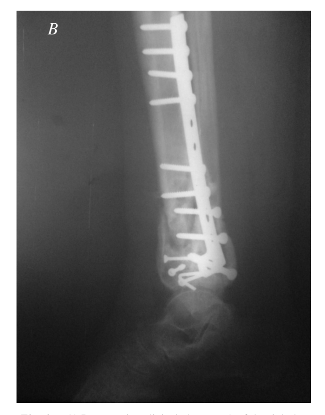
Fig. 4 — A) Preoperative clinical photograph of the right leg showing adherent scar and draining sinus, B) Preoperative lateral x. ray showing nonunion over plate fixation.

Acta Orthopædica Belgica, Vol. 84 - 4 - 2018