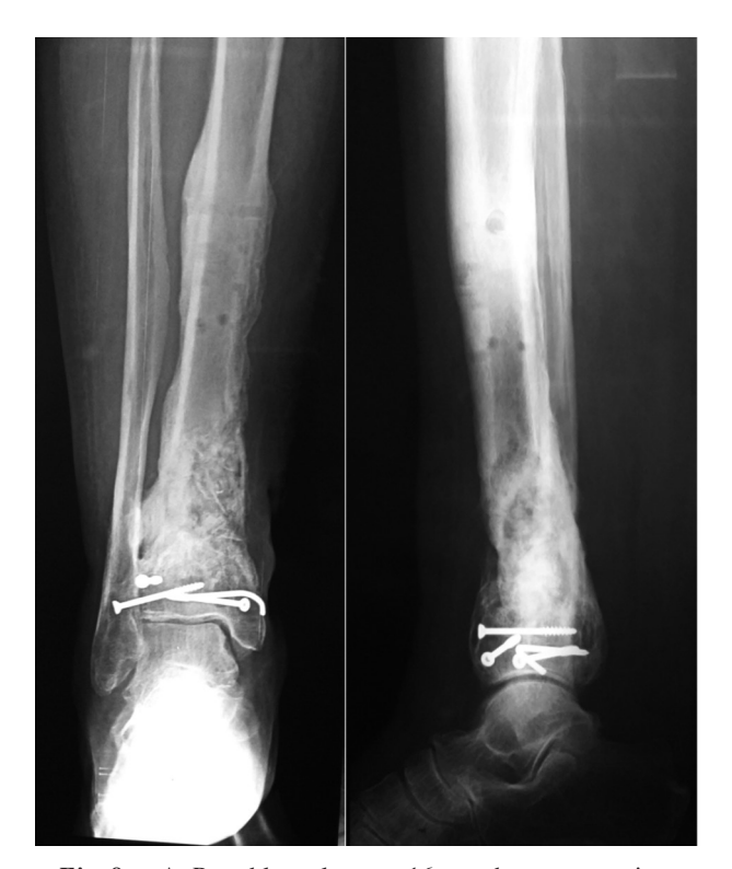
Fig. 8 – A. P. and lateral x rays 16 months postoperative showing corticalization of the graft and tibiofibular synostosis.

Acta Orthopædica Belgica, Vol. 84 - 4 - 2018