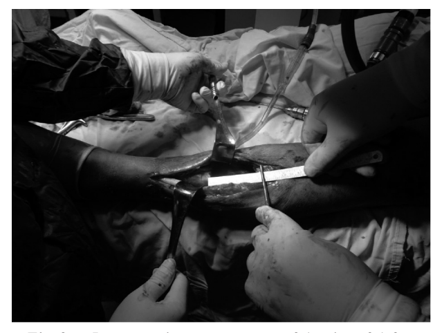
Fig. 2 — Intraoperative measurement of the size of defect

Acta Orthopædica Belgica, Vol. 84 - 4 - 2018