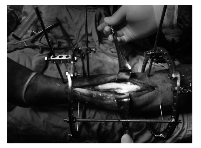
Fig. 3 — Insertion of cement spacer in the defect

Samples from infected bone and soft tissue were taken for culture and sensitivity. Double set-up (change instruments, re-prep, re-drape, new gowns/ gloves) was done in cases with infected nonunion and open fractures.