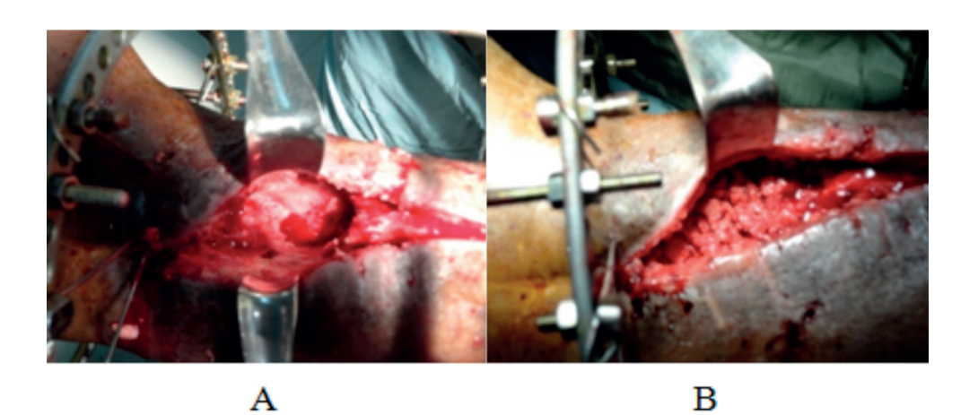
Fig. 6 — A) Intraoperative photograph during 2nd stage showing the defect surrounded with the membrane after cement removal, B) The defect filled with morcellized cancellous graft.

The end results were assessed according to the method adopted by Paley et al. in 1989 (10). They divided the final results into bone results and functional results. We modified the functional results of this score for application in upper limb cases because DASH score is difficult to apply