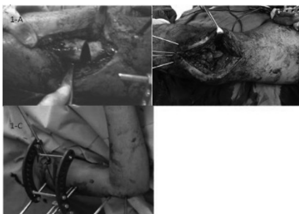
Fig. 3. — X-rays showing :A : non united fracture mid-shaft humerus fixed by double plating with fixation failure. B : Ilizarov application after removal of plates and screws. C : follow-up X-rays after apparatus removal.