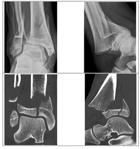
Figure 1. — Preoperative X rays and CT scanner

The results were classified into 3 categories according to the classification established by Gleizes et al (8): - Good: no pain, no stiffness, no walking impairment, no arthritis, - Fair : moderate pain, stiffness and / or discomfort in walking, without arthritis – Poor : severe pain and / or important stiffness and / or limping and / or arthritis.