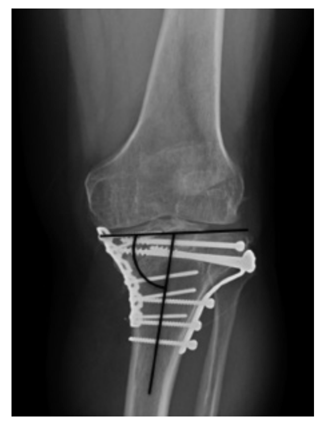
Fig. 1. – Tibial plateau angle (TPA), the angle between the diaphyseal axis of the tibia and the line between the borders of both tibial plateaus in anteroposterior view

Anteroposterior (AP) and lateral views, as well as full-leg-length AP long-standing radiographs were obtained for the radiological analysis. Time to consolidation and appearance of radiological osteoarthritis and the end of the follow-up that were not present at the trauma moment were assessed.