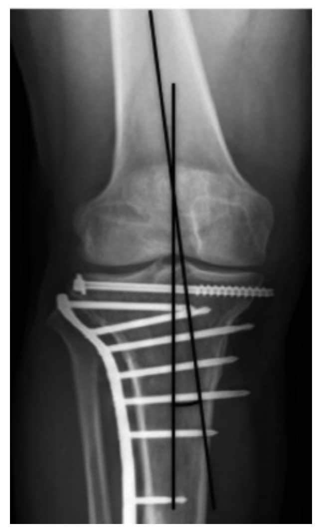
Fig. 3. – Femorotibial angle (FTA), the angle between the diaphyseal axis of the femur and the tibia

The statistical analysis was performed with the Statistical Package for Social Sciences (SPSS Inc, Chicago, IL). The Mann-Whitney test was performed for the quantitative variables and Fisher's exact test was used for the qualitative variables. A difference was established as significant if P<.05.