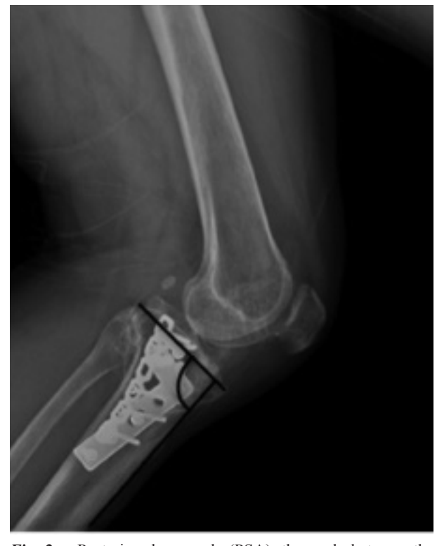
Fig. 2. – Posterior slope angle (PSA), the angle between the anterior cortex of the tibia and the line between the anterior and posterior cortical borders of the medial tibial plateau in the lateral view

Patients were reviewed at 6 weeks, 12 weeks, 6 months and 12 months after the surgery, and annually from then. The Oxford Knee Score (OKS) and visual analog scale (VAS) were used to evaluate the function and pain of the knee at the end of the follow-up.