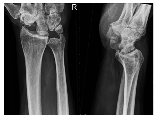
Fig. 4. —Radiography showing a status post PRC. A cyst in the proximal pole of the hamatum is discernable

which revealed a signal increase at the radiohamate interval. These images also revealed subchondral cyst formation at the proximal tip of the hamate. (Fig. 2-4) This was considered due to radiohamate impingement. Since these symptoms impeded the patient to fulfill his work requirements, a surgical intervention was suggested. A resection of the proximal pole of the hamate was performed using a dorsal wrist approach. (Fig. 5) At 1 year, the patient