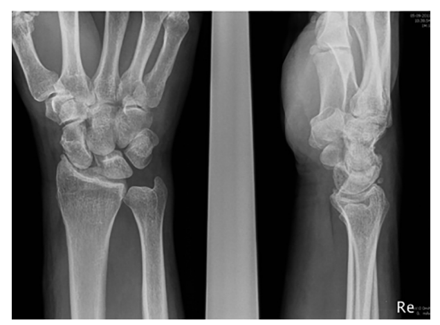
Fig. 1. — Pre-PRC image showing a stage 2 SLAC wrist