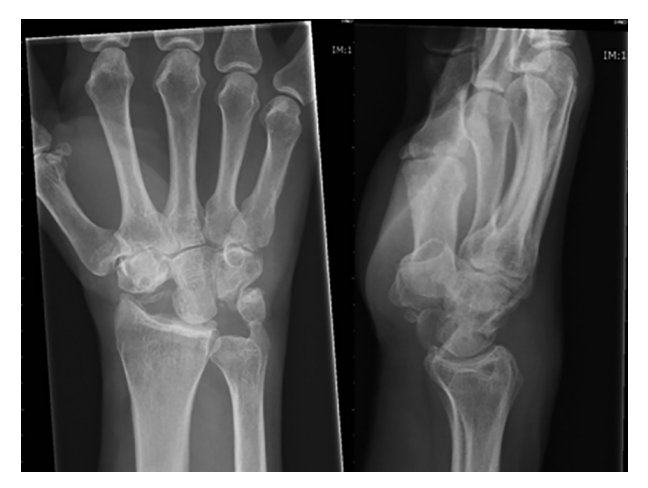
\it Fig. 5. — Status post resection of the proximal pole of the hamatum

was pain free, the flexion-extension arc was 66^{\circ} and the grip strength was 70% of the contralateral side, which was similar as immediate postoperative of the proximal row carpectomy. He was able to resume his occupation.