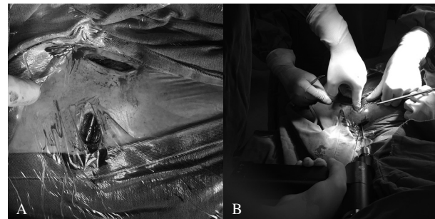
Fig. 1. — A : The coracoid base was under direct visualization. B : Bone tunnel was drilled over through the clavicle.

a Student's t test. b Chi-squared test. P < 0.05 is considered statistically significant.