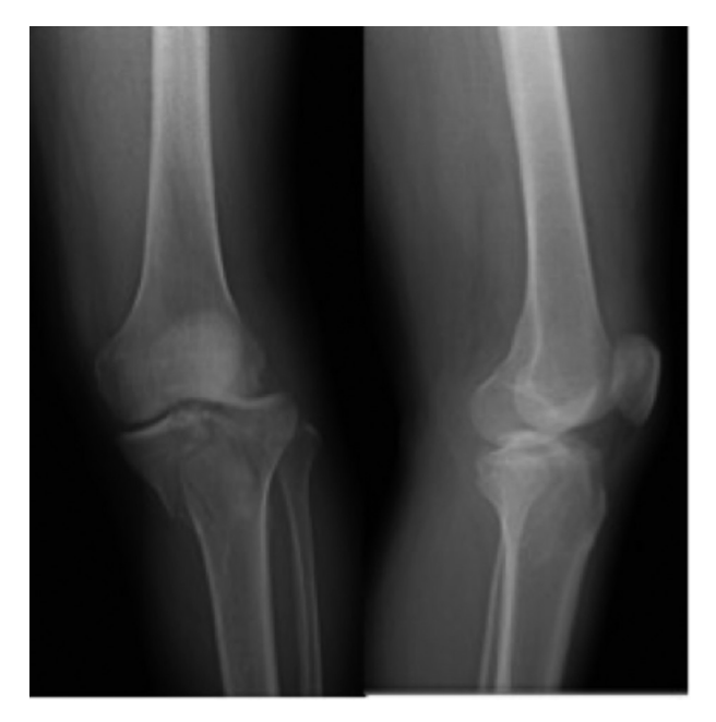
Fig. 2A. — Anteroposterior and lateral preoperative radiographic view of a 37 year old case, classified as 43-C3 regarding AO/OTA classification