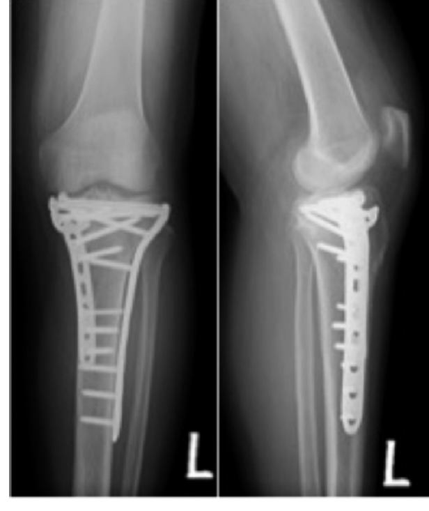
Fig. 2C. — Anteroposterior and lateral postoperative radiographic views at 3rd year following operation have shown no sign of malunion.