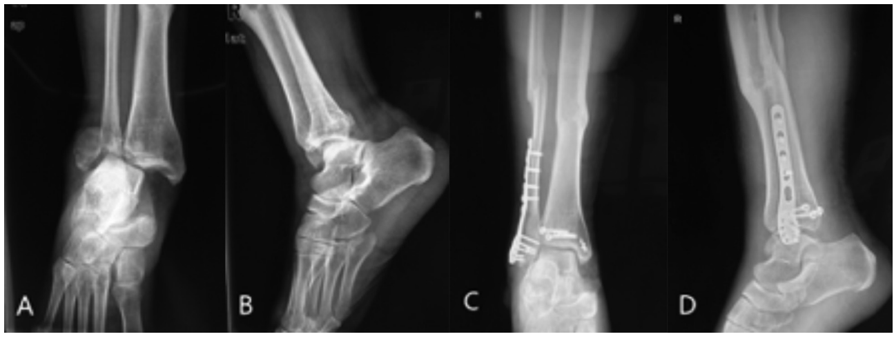
Fig. 1. — Preoperative radiographs of a 44-year-old woman with deltoid ligament rupture associated with ankle fractures. She had a history of tibiofibular fracture in ipsilateral limb with conservative treatment 31 years ago. (A.B) Postoperative radiographs of deltoid ligament repair and fracture fixation (C.D).

JIAN-JIAN SHEN, YI-BIN GAO, JIE-FENG HUANG, QING-MI QIU, LI CHENG, SONG-LIN TONG