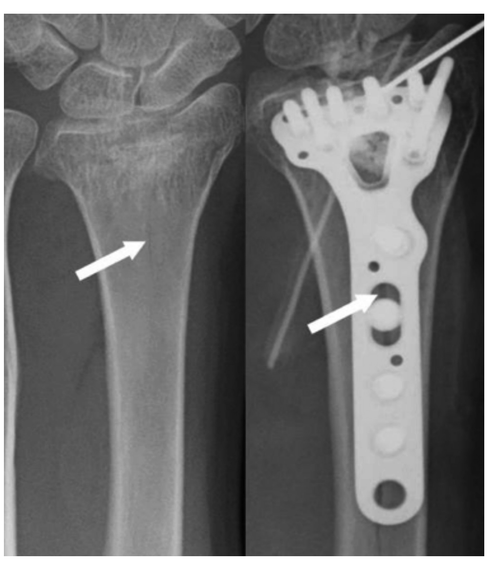
Fig. 2. — Case 1 pre- and postoperative anteroposterior radiographs of distal radius. A LC occurred before ORIF. Screw placement widened and extended the LC

likely present in the literature involving distal radius fracture management, reporting positive outcomes more often than negative (21). Despite these barriers, the dangers of this complication should be considered to provide healthcare providers and patients with the most comprehensive information about all treatment options (2).