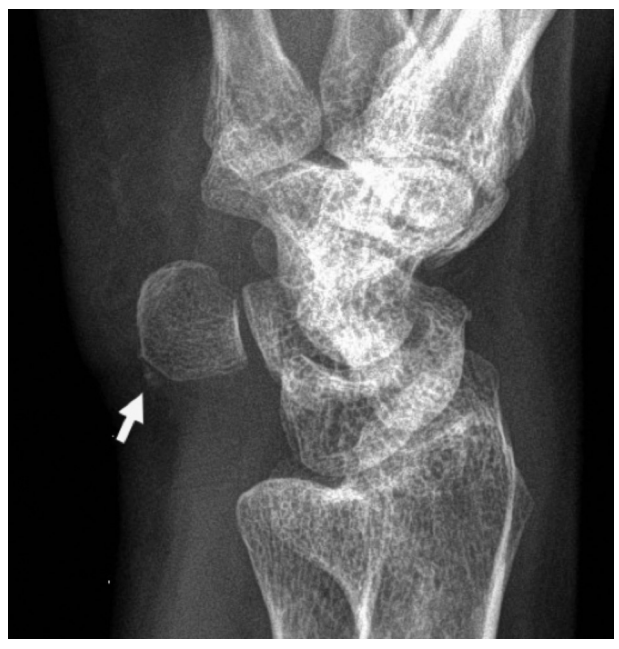
Fig. 2. — External rotation view of the wrist (30' supination A-P) of patients. A well preserved joint space of P-T and calcific deposition volar to the pisiform were noted

lateral non-affected side (1). But the difference was not statistically significant. No late dysfunction of the FCU or wrist was noted clinically (4).