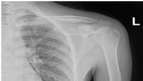
Fig. 3A-B. — The antero-posterior (AP) X-ray of left shoulder of a 45-year-old man: left distal clavicle fracture fixation with hook plate. The immediate postoperative period with good fracture reduction and fixation (A). X-ray after implant removal with localized osteoporosis and osteolysis of the distal clavicle but no bone changes in the acromion (B).