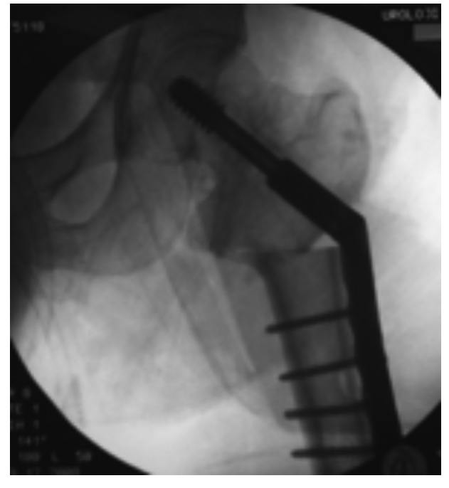
Fig. 2. — Introperative flouroscopic image