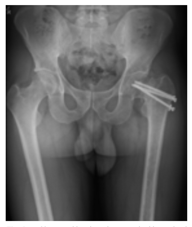
Fig. 1. — 22 years old male patient treated with canulated screws x ray (6 months after the first operation)

The level of the osteotomy is planned at or slightly superior to the lesser trochanter and is identified with fluoroscopy. The osteotomy is initiated with a horizontal cut at the intertrochanteric region. The second cut is begun inferiorly toward the apex of the osteotomy to produce the preoperatively planned osteotomy. Both cuts are initiated with a saw and completed with an osteotome. During the osteotomy, the cut is made in such a way that the osteotome does not exceed the bone by performing a corticotomy. Considering the correction of rotation, the wedge is removed with osteotomy from the proximal. Additionally, lateral displacement is formed in order to correct the displacement to the lateral at the mechanic axle due to valgisation (Fig. 3,4).