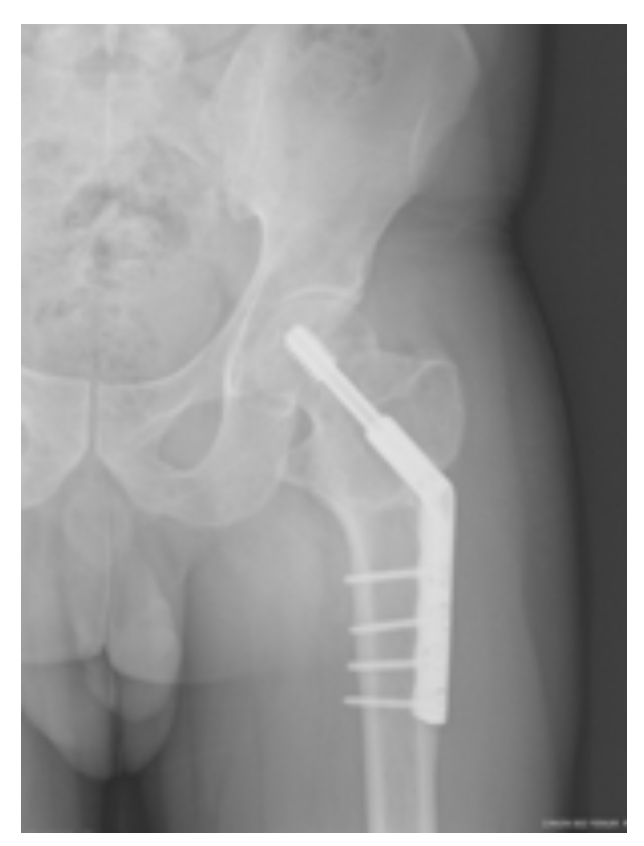
Fig. 5. — Postoperative 1 year x ray

Acta Orthopædica Belgica, Vol. 85 - 2 - 2019