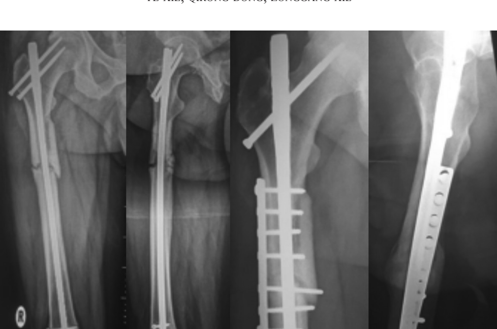
Fig. 2. —(A, B) A male patient 25 years old presented with aseptic femoral nonunion 6 months after a nail was placed. Plate augmentation with iliac bone grafting was performed to treat the nonunion. (C, D) 6 months after the surgery showing solid union.

maintains the fracture alignment. Surgery is also less extensive. It can still be performed without time loss in cases where nail removal is difficult as with broken nails and screws (12,8).