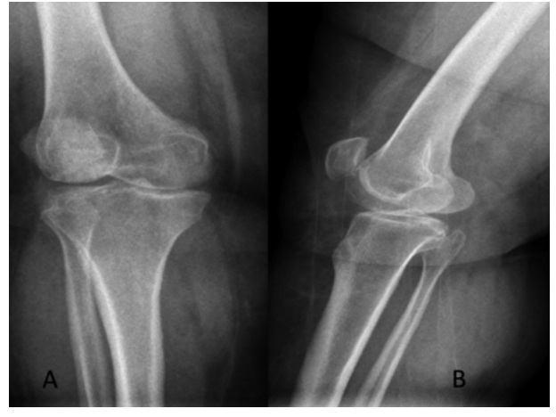
Fig. 1. - 65 year old male patient AP (A) and Lateral (B) X-rays preoperatively.

Forty (70.1%) patients were stage III and 17 (29.0%) patients were stage IV according to the Ahlback radiologic classification system (Figure 1A-B). Five (8.7%) of the patients developed superficial skin problems and 4 (80%) of these patents have DM. All of these patients recovered with superficial wound care and antibiotherapy. One patients (1.75%) who had diabetes mellitus and peripheral artery disease developed prosthesis infection in the early period and received antibiotherapy and change of polyethylene. Five (83.3%) of 6 patients who developed complication in the early period have comorbidities such as DM and peripheral vascular disease. Two (3.5%) patients developed chronic period infections, no proliferation was observed in the collected deep cultures and both the patients were treated with the change of polyethylene and washing. No any thromboembolic complication was developed such as Dvt and pulmonary embolism. Two (3.5%) patients were re-operated due to the dislocation of mobil polyethylene insert and the mobile inserts were changed with one size bigger. These patients were followed-up in the next period without problems. Roentgenograms ordered in the period after 5 years revealed asymptomatic aseptic loosening greater than 2 mm in 4 (7%) patients who were free of pain and movement restriction and currently being followed-up. The existing prosthesis were revised to total knee prosthesis