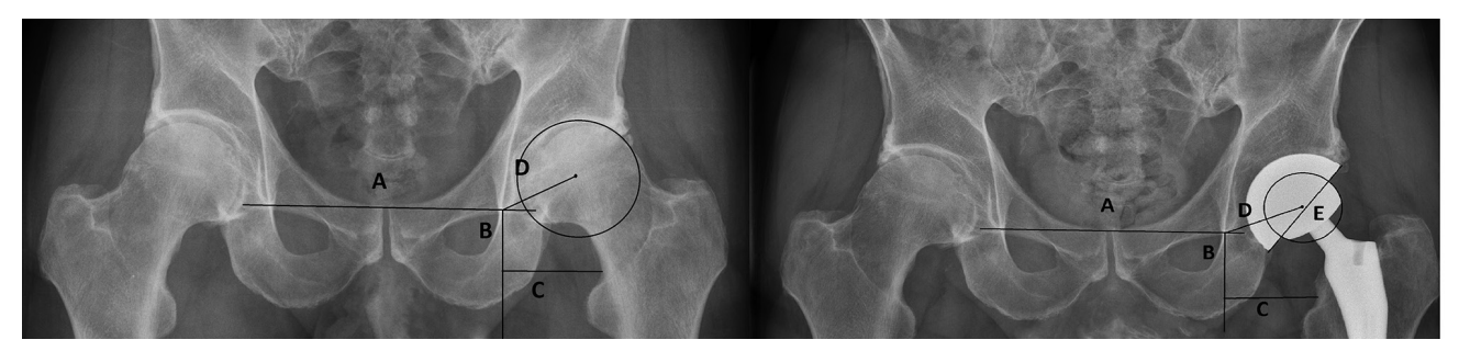
Fig. 2. — Left picture. Measurement performed on the pre-operative X-ray after calibration. First a line was drawn through the inferior aspect of the teardrop on both sides (A). A perpendicular line was drawn from the inferior aspect of the teardrop (B). On line B a line perpendicular was drawn till the superior part of the trochanter minor (C). Line B is called the Lower Limb Length and line C is the lateral offset. A perfect circle was drawn in the acetabulum. The center of this circle the center point of rotation. From this point a line is drawn to the superior aspect of the teardrop (D) this line is called the Center of Rotation Distance (CORD).

Right picture. Measurements are performed on the post-operative X-ray after calibration. First a line was drawn through the inferior aspect of the teardrop (A). A perpendicular line was drawn from the inferior aspect of the teardrop (B). On line B a line perpendicular was drawn till the superior part of the trochanter minor (C). Line B is called the Lower Limb Length and line C is the lateral offset. A perfect circle was drawn around the head of the prosthesis. The exact middle point of this circle we call the center point of rotation. From this point a line is drawn to the superior aspect of the teardrop (D) this line is called the Center of Rotation Distance (CORD). From the inferior aspect of the acetabular component a line was drawn towards the superior part of the acetabular component (E). The angle between this line and line A is called the inclination angle.