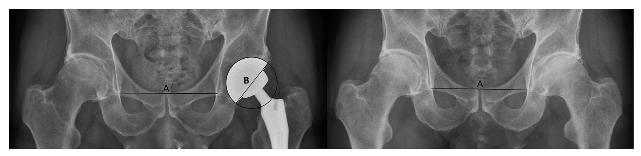
Fig. 1. — Anteroposterior radiograph of the pelvis on which we demonstrate the technique for the calibration of the X-rays. On the left picture the post-operative X-ray is shown. First a perfect fitting circle is drawn around the acetabular component. With the diameter (B) the post-operative X-ray is calibrated. After calibration of the post-operative X-ray the interteardrop line (A) is drawn between the inferior aspect of the teardrops. The distance of the interteardrop line has been measured. On the right picture the pre-operative X-ray is showed, the size of the interteardrop line (A) is used to calibrate the pre-operative X-ray.

A linear regression model was used to analyze the relation between serum cobalt with the post-