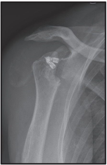
Fig. 2. — Quick shoulder joint destruction. On the left, two months after the first surgery and on the right after second surgery