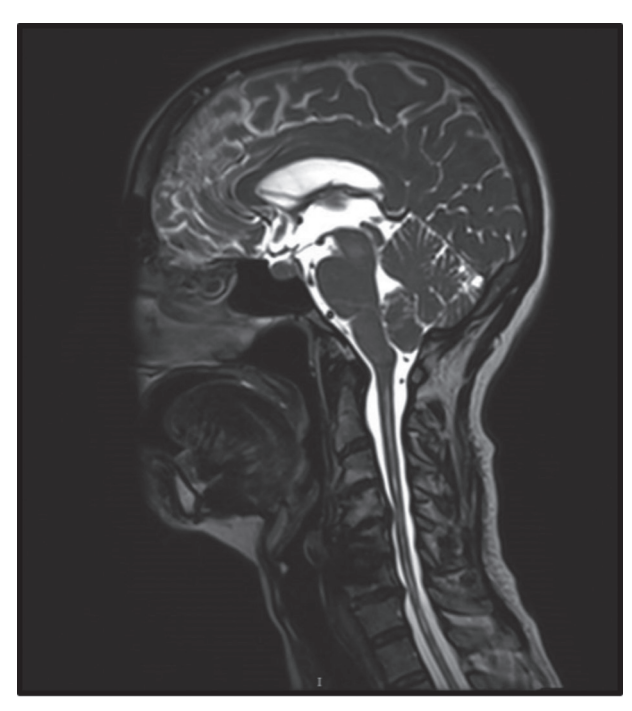
Fig. 3. — Cervical spine T2 MRI with syringomyelia C2-T1

We performed a cerebral MRI and an MRI of the cervical spine. MRIs reveal an aggravation of her Arnold Chiari disease and apparition of a multi level syringomyelia from C1 to Th1 (Fig. 3).