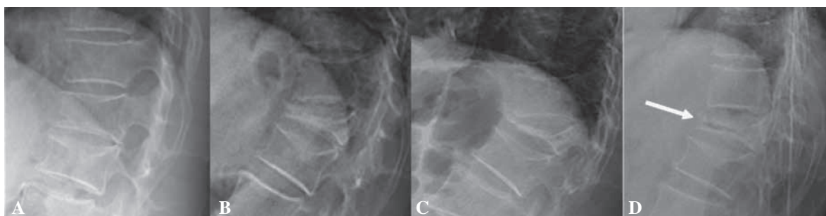
Fig. 3. — Follow-up series of a 75 yo female patient presenting with persistent back pain. A) Lateral X-ray at initial consultation (4 weeks after onset of symptoms) showing a mild sintering of the cranial endplates of L1 and L2. B) Lateral X-ray 4 weeks after initial consultation showing a collapsed L1 vertebra. C) Lateral X-ray 6 weeks after initial consultation with complete collapse and D) obvious Kummel's sign (white arrow) in the lateral fulcrum radiograph identifying a non-union of L1.

In the rare event of an unstable osteoporotic compression fracture or imminent neurological compromise, primary surgical stabilization methods should be considered in analogous manner to unstable fractures resulting from high-energy or adequate trauma.