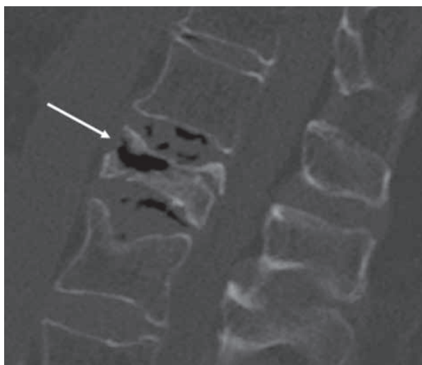
Fig. 2. — Sagittal CT image of L1 showing the pathognomonic intravertebral cleft (white arrow) in an 81 yo female patient with persisting back pain 10 weeks after onset of initial symptoms.

with proximal humerus fractures, wrist fractures and fractures of the hip, the most common complication of osteoporosis in the elderly (1). Beside the progressive socioeconomic burden associated with these complications, their consequences highly compromise the individual's activity level and overall quality of life. Studies investigating the clinical course and overall morbidity in patients with osteoporosis have demonstrated that complications secondary to unidentified or untreated vertebral fractures are associated with a significant increase of the