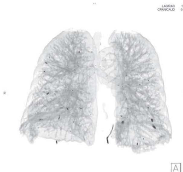
Fig. 3. — Three-dimensional reconstruction of a computed tomography lung scan of the single patient with pulmonary cement embolism after balloon kyphoplasty (black spots = cement).

Most patients are asymptomatic, and asymptomatic patients are not routinely screened with postoperative chest imaging. Symptomatic cement embolisms can be recognized via dyspnea/tachypnea, tachycardia, cyanosis, chest pain, coughing, hemoptysis, dizziness and sweating. Asymptomatic cement embolisms are more difficult to diagnose, as in the current study. Most authors do not attach too much importance to asymptomatic cement embolism and therefore do not routinely search for it in their