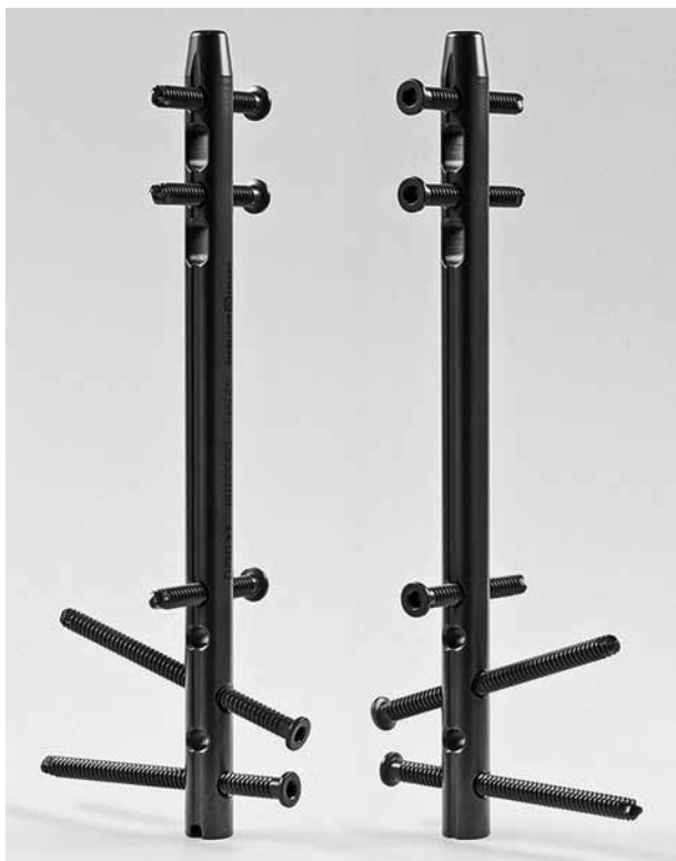
Fig. 1. — Modern Intramedullary nail specially designed for tibiotalocalcaneal arthrodesis with proximal and distal locking screws. (Ortho Solutions, Maldon, Essex, UK).

Currently there are IM nails available specifically designed for the hind foot fusion (Fig. 1).