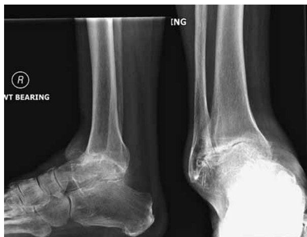
Fig. 3a. — Pre-operative radiographs of a patient showing varus deformity of hind foot secondary to severe osteoarthritis.

Traditionally the most common method for ankle and hind foot fusion was external fixation (10,13). However, firm internal fixation for hind foot arthrodesis reduces the time for immobilisation. This can possibly reduce the time to return to work as well (17). In the past the TTCA with IM nail was used for severe deformity because in addition to fusion the IM nail helps to maintain the correct alignment of the hind foot (Fig. 3a & 3b). It was commonly used as a salvage procedure for cases with failed fusion, AVN of talus and failed TAR (27,40). With new nail types and improvement in the surgical techniques the indications have expanded to include neuropathic conditions, club foot and arthritis of ankle and subtalar joints (16). The major contraindications for IM nail for TTCA are intact subtalar joint, limited bone stock in