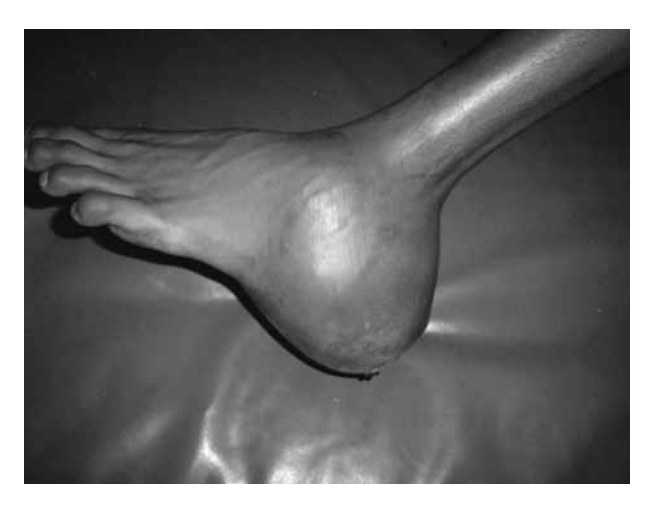
Fig. 1. — Gross swelling in the region of the calcaneus