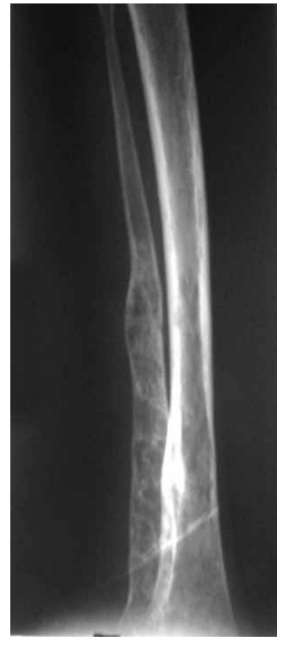
\emph{Fig. 3.} — Expansile lytic lesions in the ipsilateral tibia and fibula.

leg revealed areas of lytic destruction and thinning of the cortex in the tibia and fibula (fig 2 & 3). Fine needle aspiration cytology from the swelling was reported as Ewing's Sarcoma. CT scan study of the thorax did not reveal any chest metastases. The patient was taken up for surgery and above knee amputation was done. Histopathology from the specimen tissue confirmed the diagnosis to