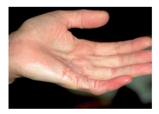
Fig. 6. — After 3 months