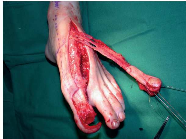
Fig. 1. — Harvesting of the composite soft tissue flap from the great toe.

The surgical technique has been described in detail before hence a brief recapitulation should suffice. (4,5,6,16,18). The procedure is done in five steps. First the recipient site is prepared. The skin incision is planned to accommodate the flap and when limited extra skin is needed a PIO flap is considered. Large skin deficits should be dealt with by preparatory flap surgery according to McGregor either by free flap surgery.- The bone is prepared to accept an autologous corticospongious bone graft from the iliac crest. The digital nerves, the sensitive branches of the radial nerve, the radial artery and the commitant veins are identified. The second step is the harvesting of the composite soft tissue flap. The big toe, including the nail, is degloved, preserving a innervated medial skin strip extending around the tip of the toe (Fig. 1). The tip of distal phalanx is cut distal to the insertion of the