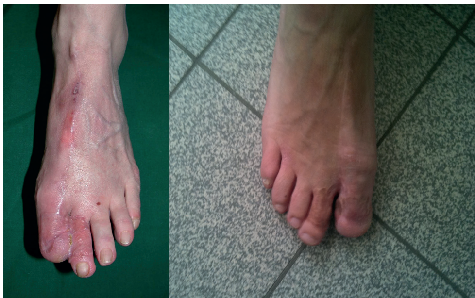
Fig. 2. — cross toe flap from the big toe (a) and after division 3 months post-op (b)