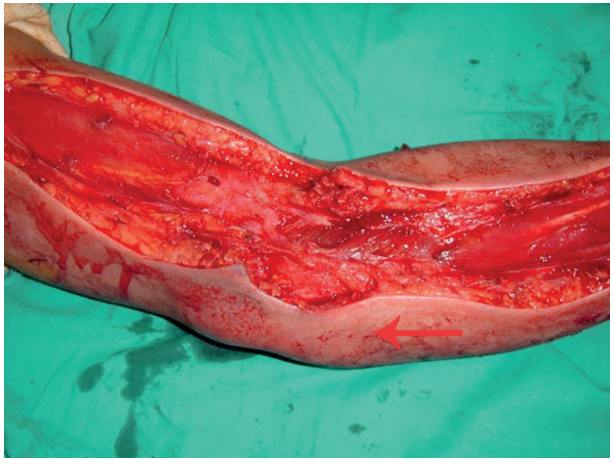
Fig II (A-B). — Detail from the frontal part of upper left limb during the first surgical debridement. Thrombosis can be observed (black arrow) throughout the superficial vessels. Note the extensive exposure of the muscular compartments in the proximity of the bite (red arrows)