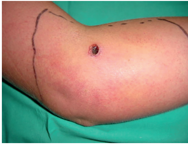
Fig. I. (A-B) — Detail of left elbow showing a central necrotic injury associated with the spiderbite. Swelling and ecchymosis are visible around the area of the inoculation of venom (marked). Extensive erythema is also visible on the distal part of the arm and proximal forearm of the upper left limb.

An X-ray of the limb revealed swelling in the soft tissue, with no presence of gas in the subcutaneous tissue.