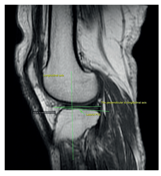
Fig. 2. – Lateral posterior tibial slope measurement

individuals from 40 to 49 years of age (14 patients), and subgroup 4 included individuals from 50 to 59 years of age (13 patients). All of the measurements were performed by the same radiologist (ATS).