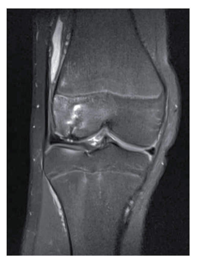
Fig. 5. — Postoperative T2 weighted coronal MRI of the knee demonstrating a well-healed osteochondral lesion with no evidence of screw protrusion

Patients may present with a painful, swollen knee, occasionally locking or with the patient unable to bear weight. The long-term effects of leaving these osteochondral defects untreated include further articular damage, associated meniscal injury and early onset osteoarthritis ( 16 ).