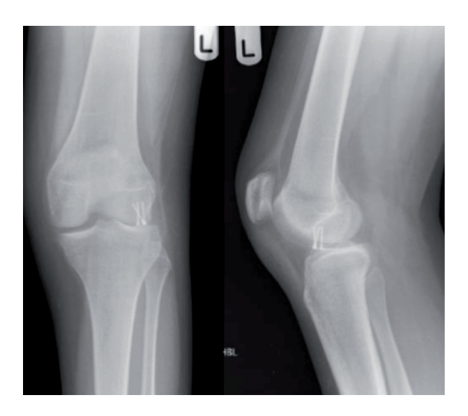
Fig. 4. — Postoperative AP and lateral radiographs of the left knee showing omnitech \mathbb{R} screws insitu, used to fix the osteochondral fragment to the lateral femoral condyle

At a mean follow up of 25.6 months (range 12 - 53) there were no revision procedures for failure of fixation.