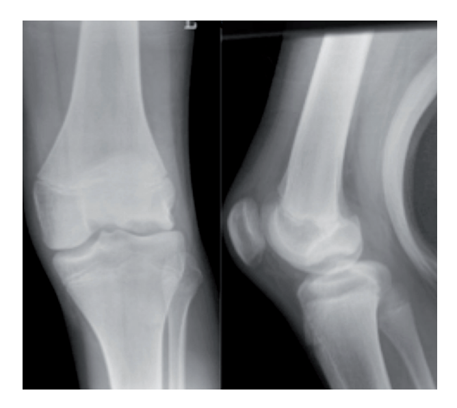
Fig. I. — AP and lateral radiographs of the left knee showing an osteochondral defect of the lateral femoral condyle

adolescents who underwent surgery for patella dislocation, locked knees and trauma between 2008 and 2012. The inclusion criteria were patients under the age of 16 presenting to our institution with injury in keeping with acute trauma. They had a preoperative anteroposterior (AP), lateral and skyline views radiographs of the knee joint showing an osteochondral lesion with open physes around the knee. A preoperative MRI was also performed.