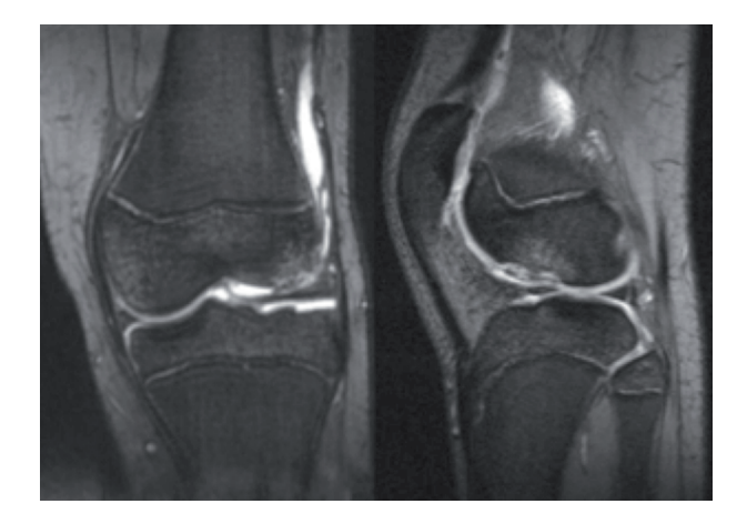
Fig. 2. - T2 weighted coronal and sagittal MRI of the left knee. An Osteochondral defect is seen within the lateral femoral condyle with associated bone bruising and large effusion present within the suprapatella burse

Acta Orthopædica Belgica, Vol. 82 - 4 - 2016