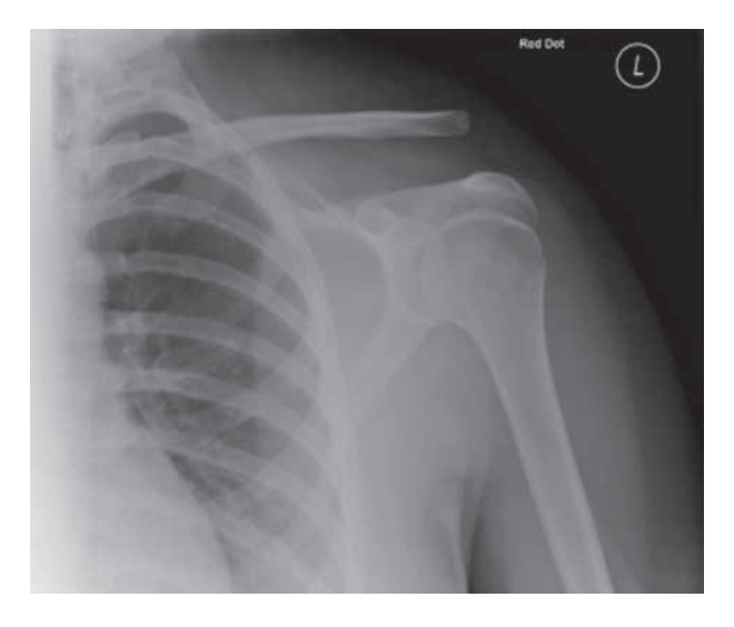
Fig. 1. — Pre-operative shoulder radiograph showing Type V AC joint dislocation.