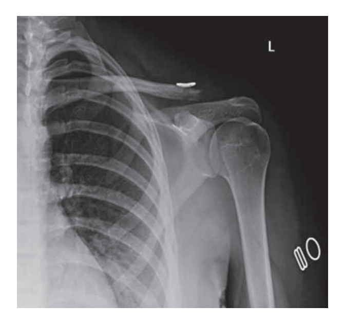
Fig. 2. — Post-operative shoulder radiograph demonstrating good fixation with TightRope.

treatment of type III remains controversial, a review of 2000 patients by Phillips et al (14), suggests no significant difference between surgical and nonsurgical methods for type III injuries. Surgery remains the mainstay of treatment of Type IV-VI injuries. The techniques vary from open, to all