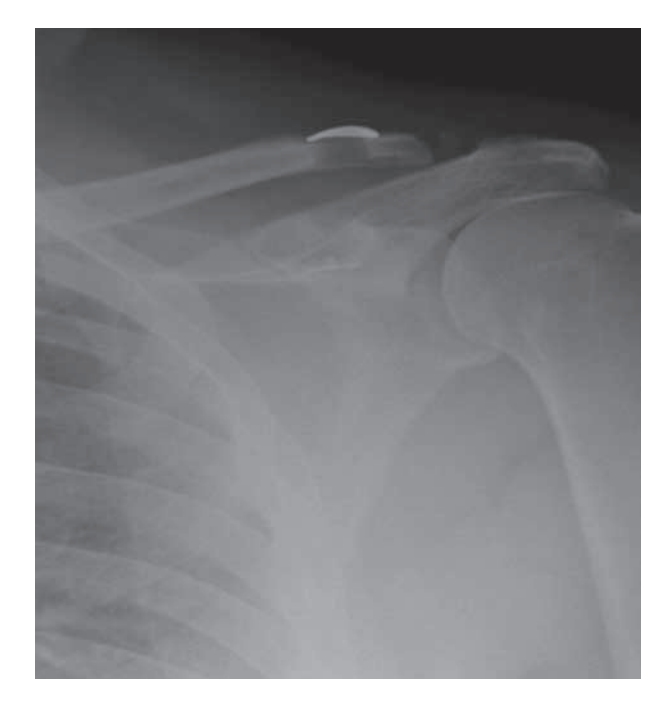
Fig. 4. — Radiographs of shoulder demonstrating widening of the clavicular tunnel in a patient with no secondary loss of reduction.

reported good outcomes with the use of these grafts (6-8,10). However, these grafts are not without problems. Ball et al (1) report a case of fracture clavicle with TightRope and Cook (4) et al report early