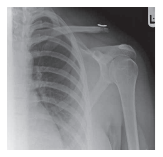
Fig. 3. — Follow-up shoulder radiographs demonstrating loss of reduction of AC joint and widening of clavicular tunnel.