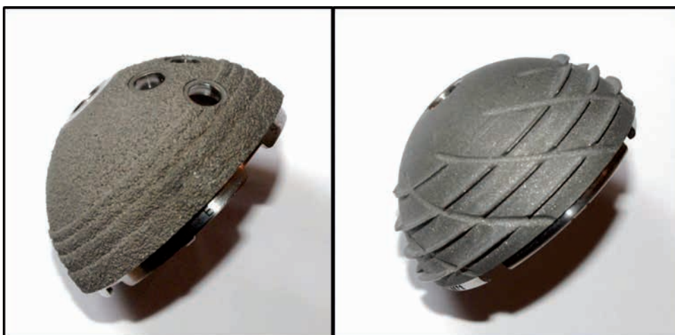
Fig. 1. — The PSL (left) and TC (right) cementless acetabular cups. The dome hole is sealed with a flat screw before insertion of the PE liner. The PSL cup offers additional screw options.

lever-out forces and interface micromotions (18,22, 26,28). Despite their biomechanical advantages, threaded cups continue to raise concern because of their variable clinical results (6,13,21,24,25,27). Complications reported for their first two generations include early loosening, cup breakage and soft tissue damage as well as local strain concentrations followed by osteonecrosis caused by the thread teeth (8,9,12,21,30). A new hemispherical cup with a relatively low thread relief and special flute design (Fig. 1) may address these concerns. The new thread design may avoid soft tissue complications and allow bone-preserving intraoperative unscrewing and cup repositioning. This should facilitate insertion, resulting in a more reproducible component position and high contact area between the bone stock and implant. However, to date no data are available to indicate whether the new threaded cup design provides primary stability, osseous integration and a clinical outcome comparable to the well-established press-fit cup.