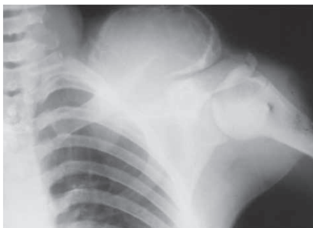
Fig. 3. — AP view of the left shoulder in a 19-year-old woman : aneurysmal bone cyst in the lateral part of the clavicle.

constitute incidental radiographical findings. They can also be brought to light by a pathologic fracture. UBCs seldom persist beyond early adult life (7), but can occasionally be seen in elderly persons, up to 83 years in the current series.