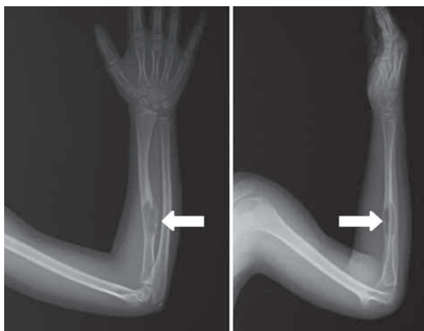
Fig. 1. — AP and lateral view of the right forearm in an 11-year-old boy : unicameral bone cyst. Localization rather unusual.

distribution of the cysts was as follows : humerus 36.5%, femur 28.6%, calcaneus 13.8%, tibia 7.9%, fibula 3.9%, radius 1.6%, talus 1.4%, finger phalanges 1.4%, ilium 1.1%, acetabulum 0.8%, scapula, scaphoid, lunatum, metacarpals, metatarsals, toe phalanges each 0.77%, ulna 0.5%.