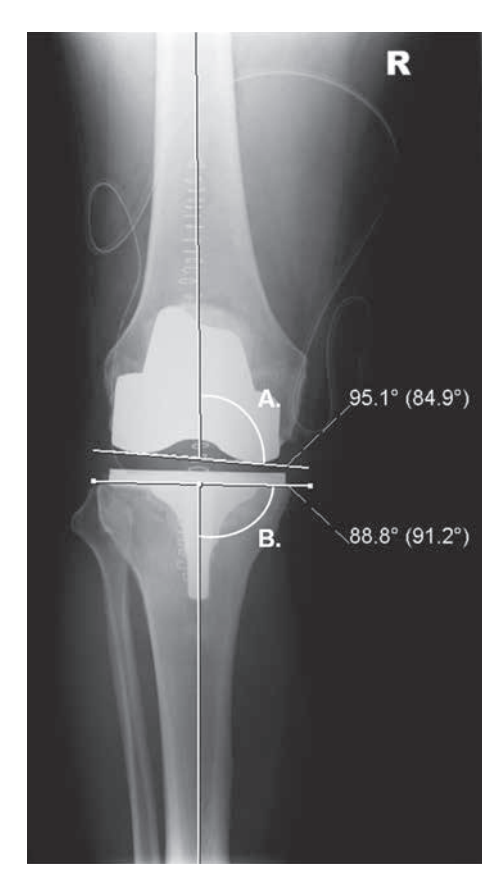
Fig. 2. — Antero-posterior initial post-operative radiographs to illustrate radiographic parameters taken as per the American Knee Society (6). A) Frontal Femoral Flexion Angle. B) Frontal Tibial Angle.

totally scores 5. The final score is calculated by subtracting the score from the questionnaire from 60. A maxi-