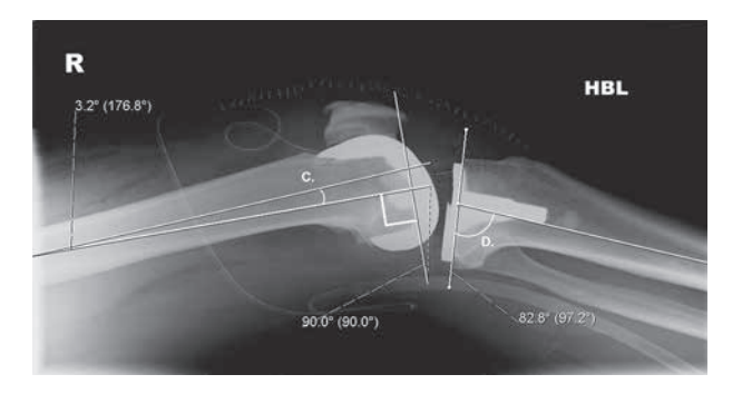
Fig. 3. — Lateral initial post-operative radiographs to illustrate radiographic parameters taken as per the American Knee Society (6). C) Lateral Femoral Flexion Angle. D) Lateral Tibial Angle.

totally scores 5. The final score is calculated by subtracting the score from the questionnaire from 60. A maxi-