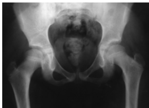
Fig. 3. — 5-month radiographic follow-up showing the healing of the fracture.

described a fracture of this type in a 14-year-old malnourished child (2). To date, 13 cases have been reported in children between 5 and 16 years of age. Only one case of bilateral involvement was found in our review of the literature, in an 8-year-old child (5). In children, osteogenesis imperfecta and myelomeningocele are associated with an increased risk of femoral neck insufficiency fractures.