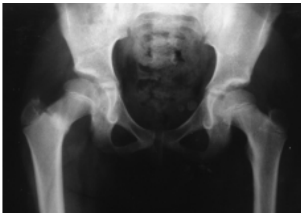
Fig. 1. — Radiograph showing an advanced fatigue fracture of the right femoral neck.

was classified as type III using Delbet's classification, compression fracture according to Devas, type I according to Blickenstaff and Morris and stage 2 according to Fullerton and Snowdy.