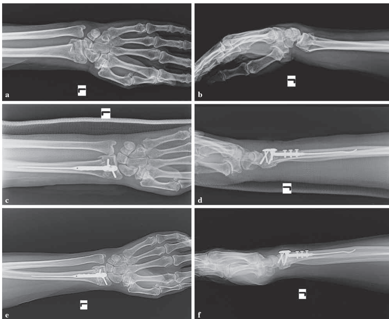
Fig. 2. — DNP surgical method a) preoperative anterior-posterior x-ray b) preoperative lateral x-ray, c) early postoperative anterior-posterior x-ray, d) early postoperative lateral x-ray, e) 12 week follow up postoperative anterior-posterior x-ray, f) 12 week follow up postoperative lateral x-ray.

position was used for 3 weeks in all cases. The percutaneous wires were usually removed after 3 weeks of immobilization with sedation in the operation room. A protective splint was applied after the removal of the cast. The splint could be removed for bathing and exercise, and was discontinued after 4 to 6 weeks once solid union was obtained.