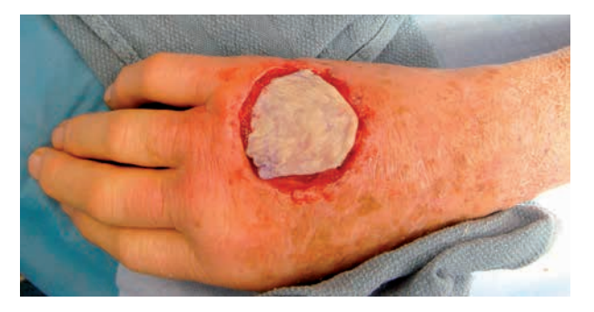
Fig. 4. — A skin graft (either full thickness or partial thickness) may be applied; alternatively, small wounds may be allowed to granulate in and heal by secondary intent. In this case, a thin full thickness graft was obtained from the upper arm and will be applied as a skin graft.

Rehabilitation and monitoring of the wound is similar to other methods of wound coverage and proceeds in the usual fashion. Typically, the color of the wound bed and matrix is monitored. Inosculation and neovascularization has been reported to begin as soon as 24 hours post application, particularly in association with use of negative pressure devices (2,13). Usually, the matrix has good "take" and the wound is ready for a second stage skin graft between 2-4 weeks ; this is marked by the change in color of the wound bed to a yellowish-pink hue (8,16,19) (Fig. 3). At this point, the silastic layer may be peeled off and a full or partial thickness skin graft applied (Fig. 4). Alternatively, small defects may be allowed to granulate in over time. Wounds are followed until completion of healing (Fig. 5). Choice of use of bilayer or monolayer, meshed or unmeshed Integra, and timing (if any) of subsequent skin grafting was based upon the discretion of the treating surgeon.