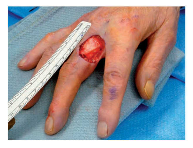
Fig. 1. — The wound is prepared and debrided of any non-viable tissue; need for additional soft tissue coverage is assessed.

The surgical techniques and indications for application of this material have been described previously (16). In general, the surgical field is prepared and any nonviable tissue is debrided (Fig. 1). Any active infection or