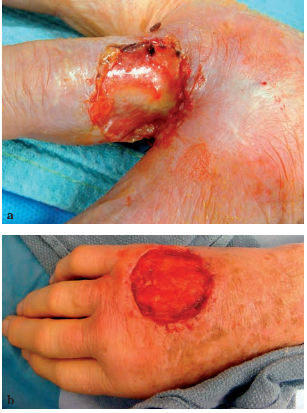
Fig. 3. — The color change to a salmon hue is indicative of the neovascularization and readiness for removal of the silastic template and skin grafting. a : same patient as in figures 1 &2 ; b : in an elderly man following excision of a large squamous cell carcinoma leaving exposed tendon.

Rehabilitation and monitoring of the wound is similar to other methods of wound coverage and proceeds in the usual fashion. Typically, the color of the wound bed and matrix is monitored. Inosculation and neovascularization has been reported to begin as soon as 24 hours post application, particularly in association with use of negative pressure devices (2,13). Usually, the matrix has good "take" and the wound is ready for a second stage skin graft between 2-4 weeks ; this is marked by the change in color of the wound bed to a yellowish-pink hue (8,16,19) (Fig. 3). At this point, the silastic layer may be peeled off and a full or partial thickness skin graft applied (Fig. 4). Alternatively, small defects may be allowed to granulate in over time. Wounds are followed until completion of healing (Fig. 5). Choice of use of bilayer or monolayer, meshed or unmeshed Integra, and timing (if any) of subsequent skin grafting was based upon the discretion of the treating surgeon.