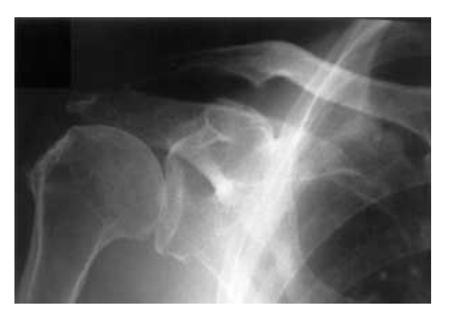
Fig. 3. — Radiograph taken 11 months after surgery, showing the enlarged space between the clavicle and the coracoid process.

The existence of a joint between the clavicle and the coracoid process is rare (1). In 1939, Gradoyevitch (1) reported that only 15 cases were known to the medical science. Ten cases had been confirmed anatomically, and five cases had been demonstrated radiographically. Gradoyevitch reported one patient with bilateral coracoclavicular joints. Nutter (4) reviewed 1000 random radiographs of adult shoulders and found 12 with coracoclavicular joints : an incidence of 1.2%. Six of 12 cases were bilateral, and 11 occurred in men. Liberson (2) reported an incidence of nine patients among 1800 shoulders studied (0.5%) ; five had bilateral coracoclavicular joints. According to Wertheimer (6), Poirier found one case in 2300 shoulders (0.04%).